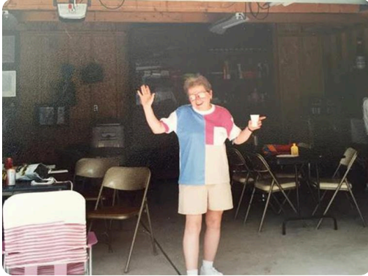
Best Maritime Day Host