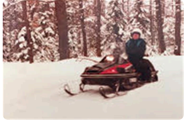
Reed Ranch Leading the pack!